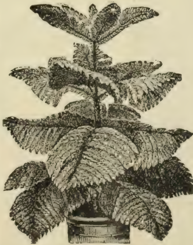
ARAUCARIA EXCELSA, Norfolk Island Pine. See description on page 12.